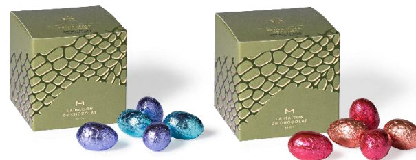
Small Praliné Egg Case 200g