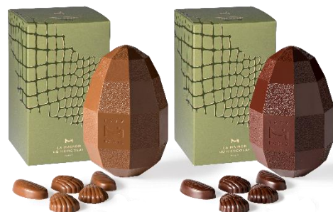
Chocolate Maison Egg (Small) 175g