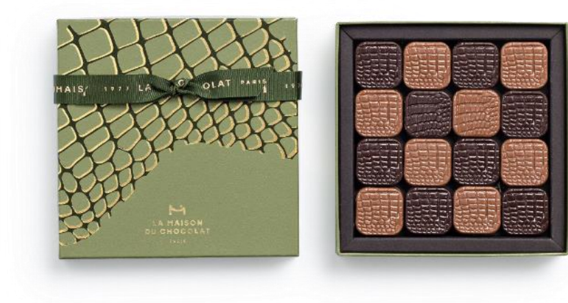
Crocodile Skin Bouchée 88g