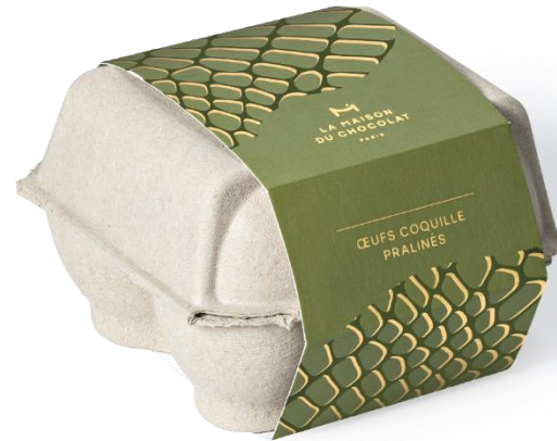
Praliné Eggshell, 4 Pieces 240g