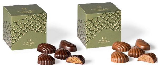
Praliné Treat Gift Box 200g