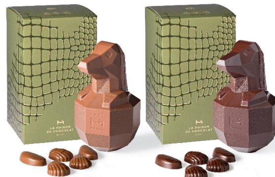
Chocolate Crocodile Egg 210g