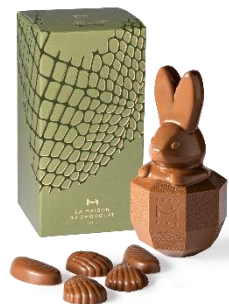
Milk Chocolate Rabbit 110g