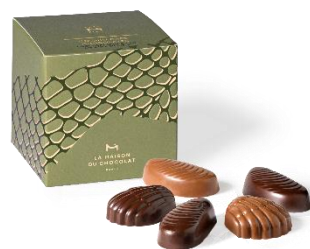
Mix Treat Gift Box 200g