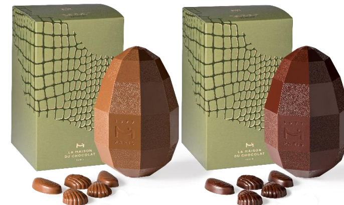
Chocolate Maison Egg (Big) 300g