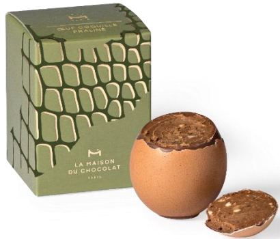
Praliné Eggshell, 1 Piece 60g

Like a “soft-boiled egg” waiting to be cracked open, the Egg Shell evokes the simple pleasures of pure indulgence.