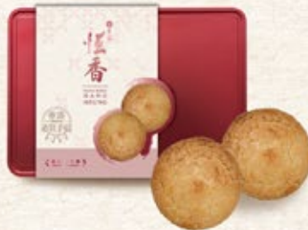
12 杏仁一口酥 (18件pcs / 234克) Mini Almond Shortbread