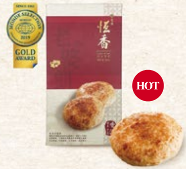
10 恆香老婆餅禮盒-原味 (6件pcs / 510克) Wife Cake Gift Box - Original