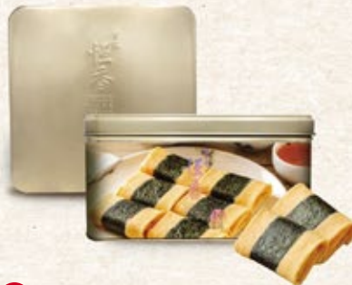
9 紫菜肉鬆鳳凰卷 (30件pcs / 300克) Phoenix Rolls with Seaweed and Pork Floss