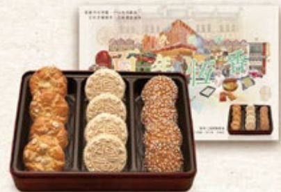
13 恆香三式唐餅禮盒 (12件pcs / 216克) Hang Heung Chinese Cakes Triple Set