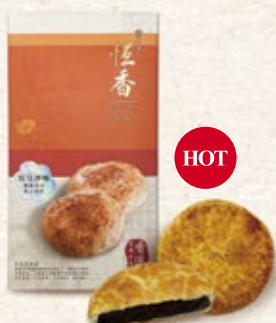
11 恆香老婆餅禮盒-少甜原味 (6件pcs / 510克) Hang Heung Wife Cake Gift Box Less Sweet Flavor