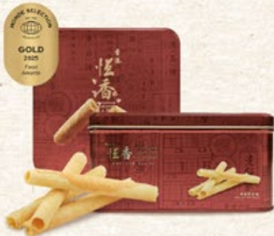
8 蜂巢雞蛋卷 (21支pcs / 400克) Country Egg Rolls